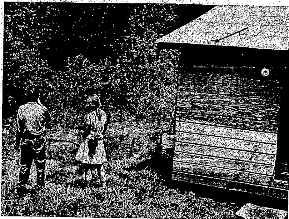
Unmanicured yard of hillside house is site of picture-taking. Photographer said he emerged from door at right and ran to this spot to make the one exposure he got.

◀ Sole witness points to tree UFO passed over, as NICAP aide stands nearby to record his comments. Tree appears in center of original photograph.